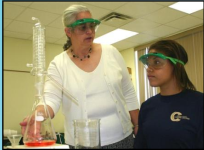
The graduation rate for Ohio career-technical workforce students is 95%.*