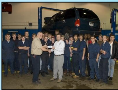
Approximately one in four of Ohio high school students are enrolled in career-technical education programs. At least 60% are high school juniors and seniors.*